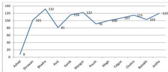
Figure 1. Monthly Trend of Abortion Services. (n=1196)

The total numbers of women of reproductive age were 33151. Total 1196 women have received abortion services and abortion rate was 36.077 per 1000 (15-49 Years women). Most of the women (90%) were more than 20 years of age.